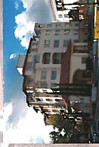
WINTER PARK HOME

SHOWROOM: 3065 PENNINGTON ROAD, ORLANDO, FL 32804